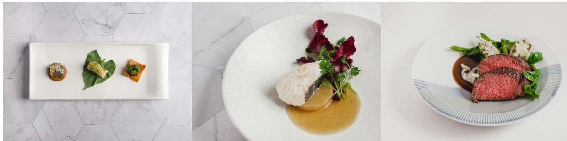
Photo Caption (L-R): Snacks – Brown Butter Mushroom Pate on Almond Crisp, Citrus Seabass Belly & Peppery Rami Nettle, Smoked Tomato Chutney on Thyme-Manchego Tuile. Appetiser – Local Trevally, Daikon, Grilled Cabbage Broth. Main – Chipotle-Berry Glazed Wagyu Chuck Tender, Vegetable Jus & Spiced Malabar Spinach